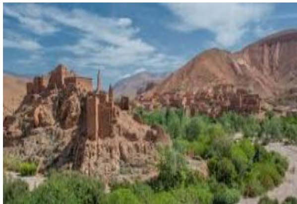
Figure 3: Tourist Areas in the Countryside of the Kingdom of Morocco