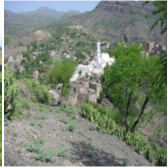
Ahmed Bin Alwan Mosque