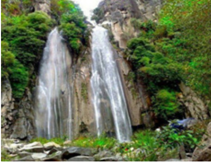
Wadi Bana Waterfall