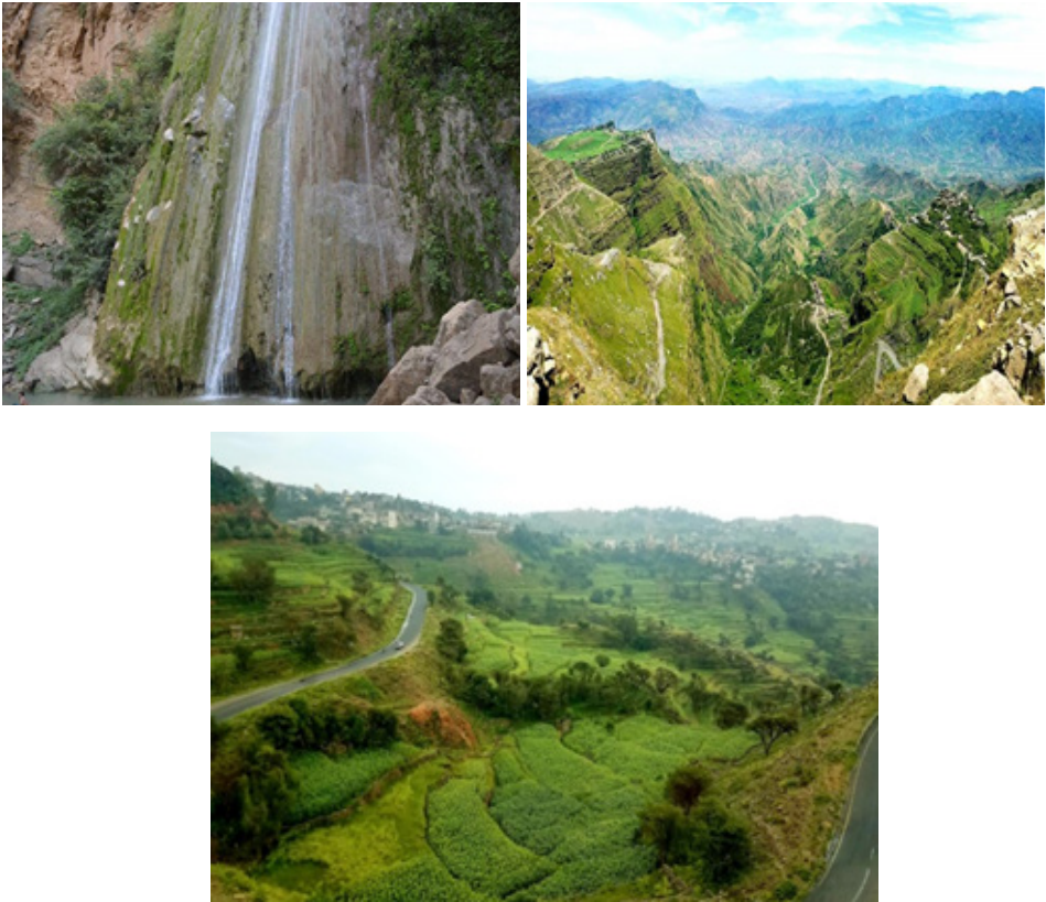
Figure (5): Natural and historical landscapes in Al-Mahwit governorate