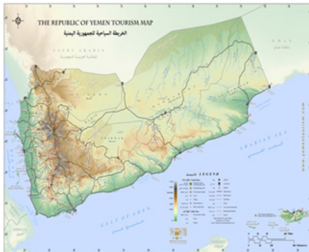
Figure (1): Touristic areas in the Republic of Yemen