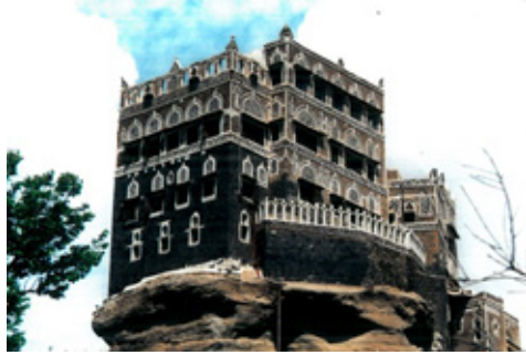
Dar Alhajar (stone house)