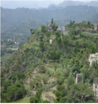
Mosque of Eshab-El-Kehf (the Seven Sleepers)-Jabal Sabr