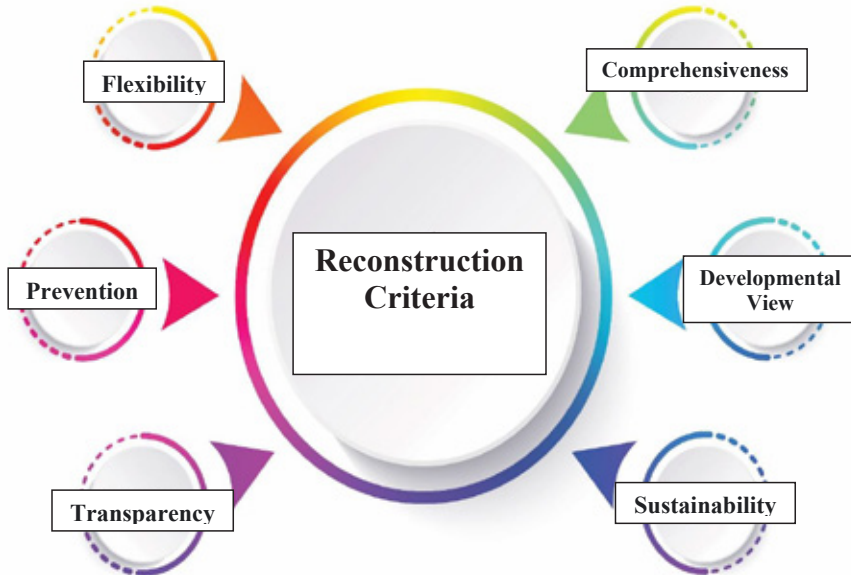
Figure N° 2 - Criteria for the Reconstruction Process