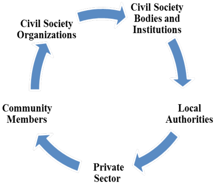
Figure N° 3 - Active Partners in the Reconstruction Process